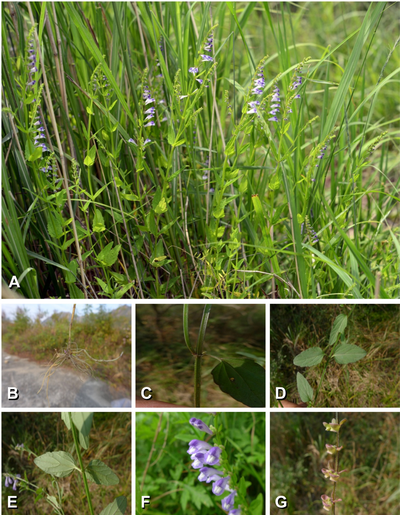
Fig. 2. Photographs of Scutellaria barbata D. Don. A. Habit. B. Rhizome. C. Stem. D. Leaf (adaxial surface). E. Leaf (abaxial surface). F. Flower. G. Nutlets.